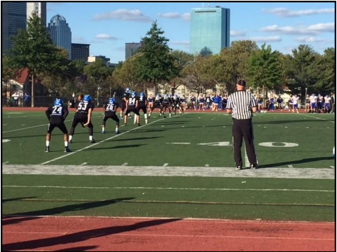
From top to bottom: Photos from the 2nd Annual O'B Community Potluck on 9.27.17 (5 photos); the O'B Tigers Football & Cheerleading teams from the game on 9.29.17 (2 photos)