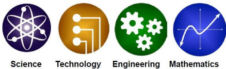
Science Technology Engineering Mathematics