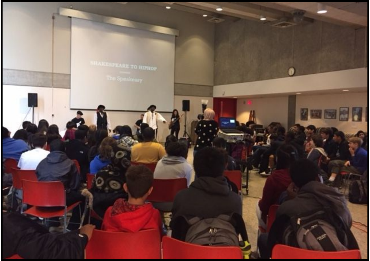
MS students watching a performance by Shakespeare to Hip Hop at the Dudley Branch of the Boston Public Library